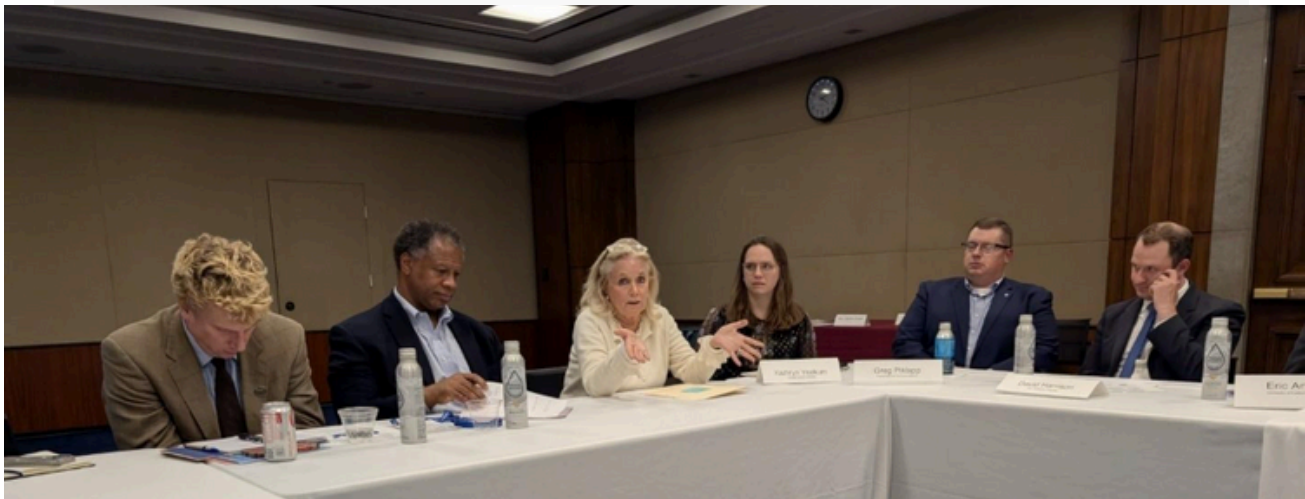
Rep. Debbie Dingell (D-MI) speaks to the Business for Federal Research Funding Coalition Roundtable on Capitol Hill on Tuesday, September 16, 2025.

On September 16-17, representatives from 13 chambers and business associations traveled to Washington, D.C. to meet with partner organizations, Senators, and members of Congress to discuss the importance of research funding for local economies across the country and global competitiveness. Led by the Detroit Regional Chamber, participating members included representatives from Ohio, Wisconsin, Virginia, California, Pennsylvania, North Carolina, Iowa, California, New York, and Massachusetts.